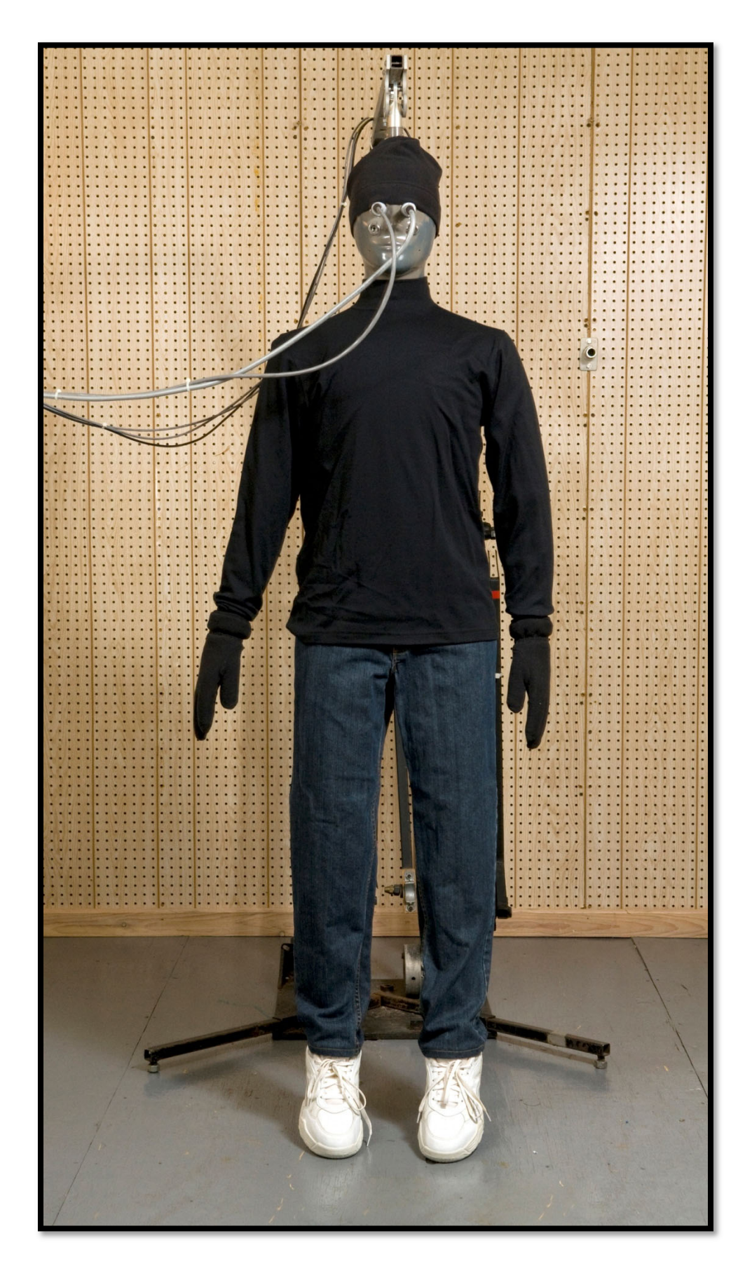
Figure 2. Stan dressed in ASTM Base Ensemble #1.