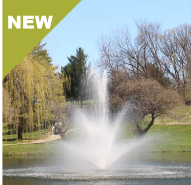
BALSAM - 3HP