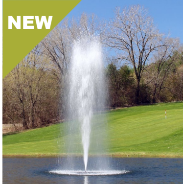
SPRUCE - 5HP