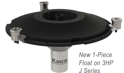
New 1-Piece Float on 3HP J Series