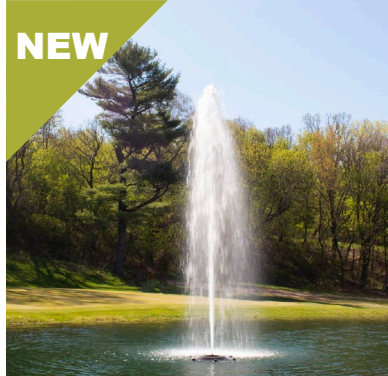
REDWOOD - 3HP