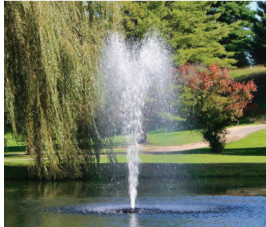
SEQUOIA - 1HP