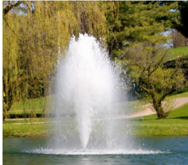
BIRCH - 2HP