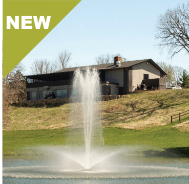
LINDEN - 3HP