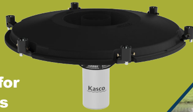
New 1-Piece Tapered Float on 5HP VFX

1-Piece tapered float for 2 & 5HP units provides easier installation & improved look.