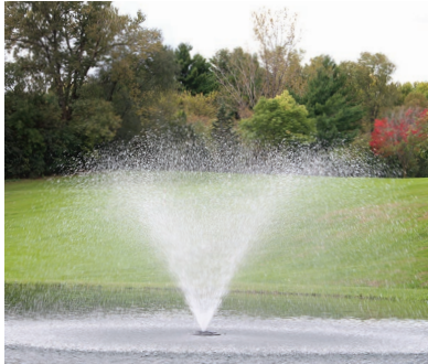
WILLOW - 1HP