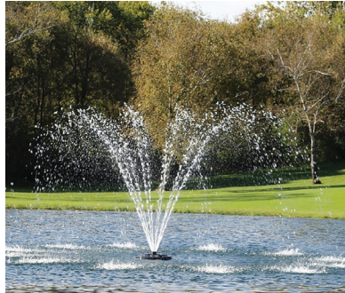
CYPRESS - 3/4HP