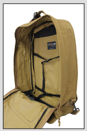
Large Main Compartment