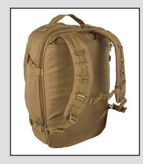
Padded Shoulder Straps