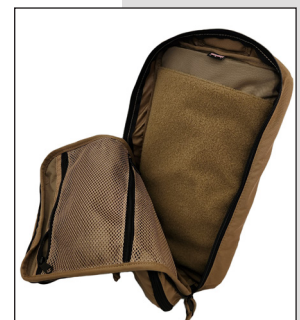
LARGE MAIN COMPARTMENT