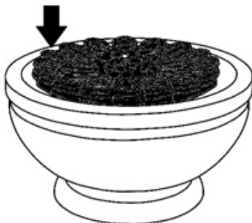
FT-146A (55 lbs) 20.25"W x 4"H