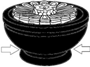
FT-146C (202 lbs) 27.5"W x 15"H

Assemble your fountain on a level surface capable of holding a minimum of 383 pounds with an approximate 1.5 square foot footprint.