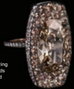
Shield Ring Diamonds and gold

An exhibit at the Phillips Auction House in New York & London.