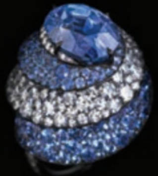
Ribbon Ring Sapphires, diamonds, and gold