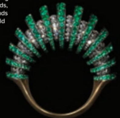
Tube Ring Emeralds, diamonds and gold