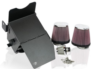
Air Box Removal Kit