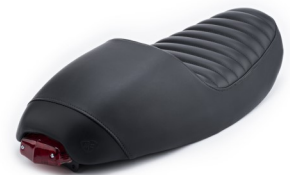
Café Racer Seat