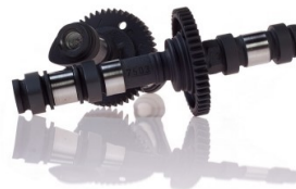
Stage 1 Cam Service