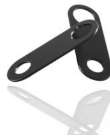
Rear Turn Signal Relocation Bracket