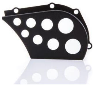
Front Sprocket Cover