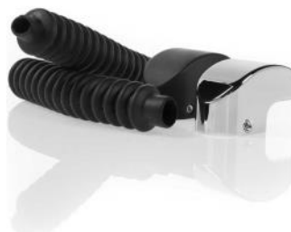
Clutch Arm Finisher