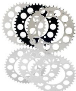
Retro Rear Sprocket