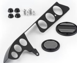
T120 TRIM PACKAGE