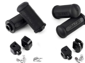
BATES FOOT PEG PACKAGE

WARNING: Laws concerning this product vary from state/province to state/province. Your state/province may prohibit its use on public roads or restrict its use to novelty, show use, off-road areas, or race facility areas only. In some states/provinces off-road uses are also prohibited. The manufacturer and retailer assume no responsibility for any use or application of this product in violation of any applicable law. Check applicable laws and regulations before installing products.