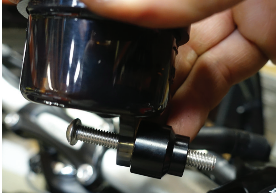
Screw > Tab > Spacer > Clamp