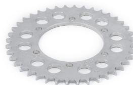
Vintage Rear Sprocket