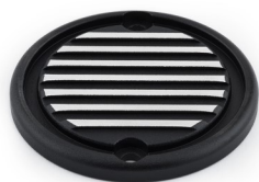
ACG and Clutch Badges