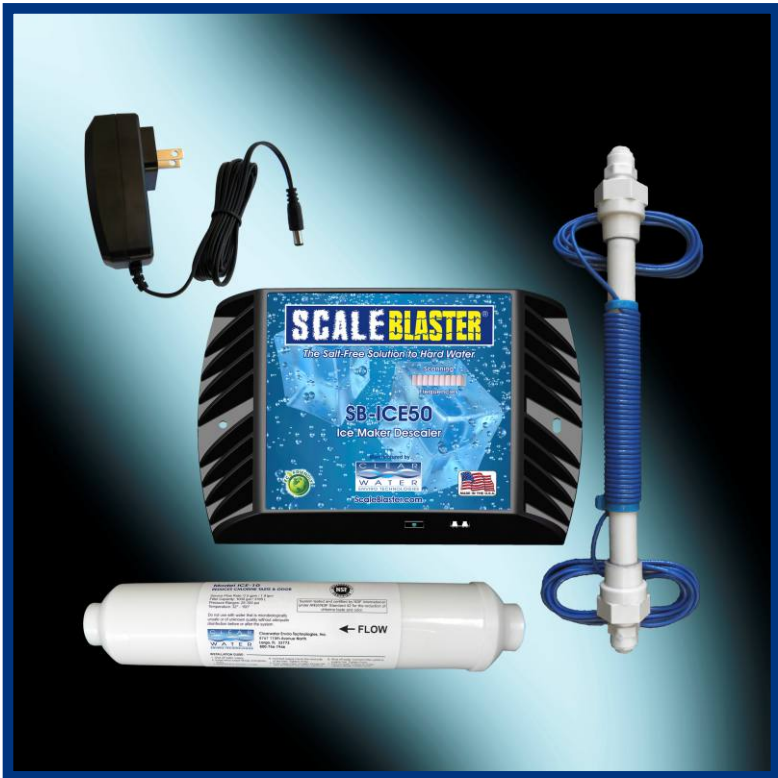
Commercial Ice Maker - Descaler & Filter