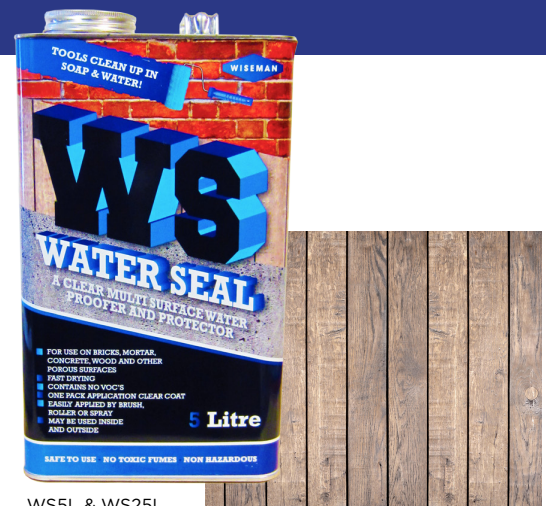
WS5L & WS25L