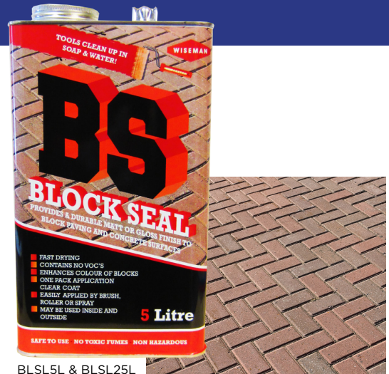
BLSL5L & BLSL25L