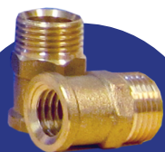
Filling loop adapter for injector Cartridges ERFLP1