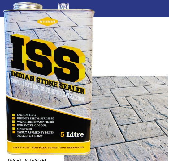
ISS5L & ISS25L