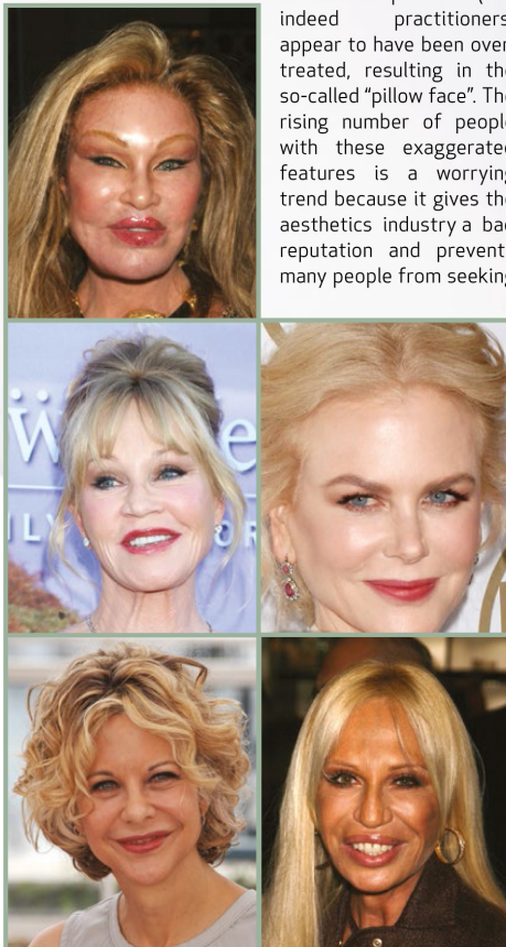
Figure 1: The Pillow Face

In terms of aesthetic procedures, we need to take a step back and consider the face as a whole rather than focus on isolated parts and trust our innate senses, rather than formulations, to restore the patient's ideal facial shape. This is a good place to start as it forces us to look at the "bigger picture". >