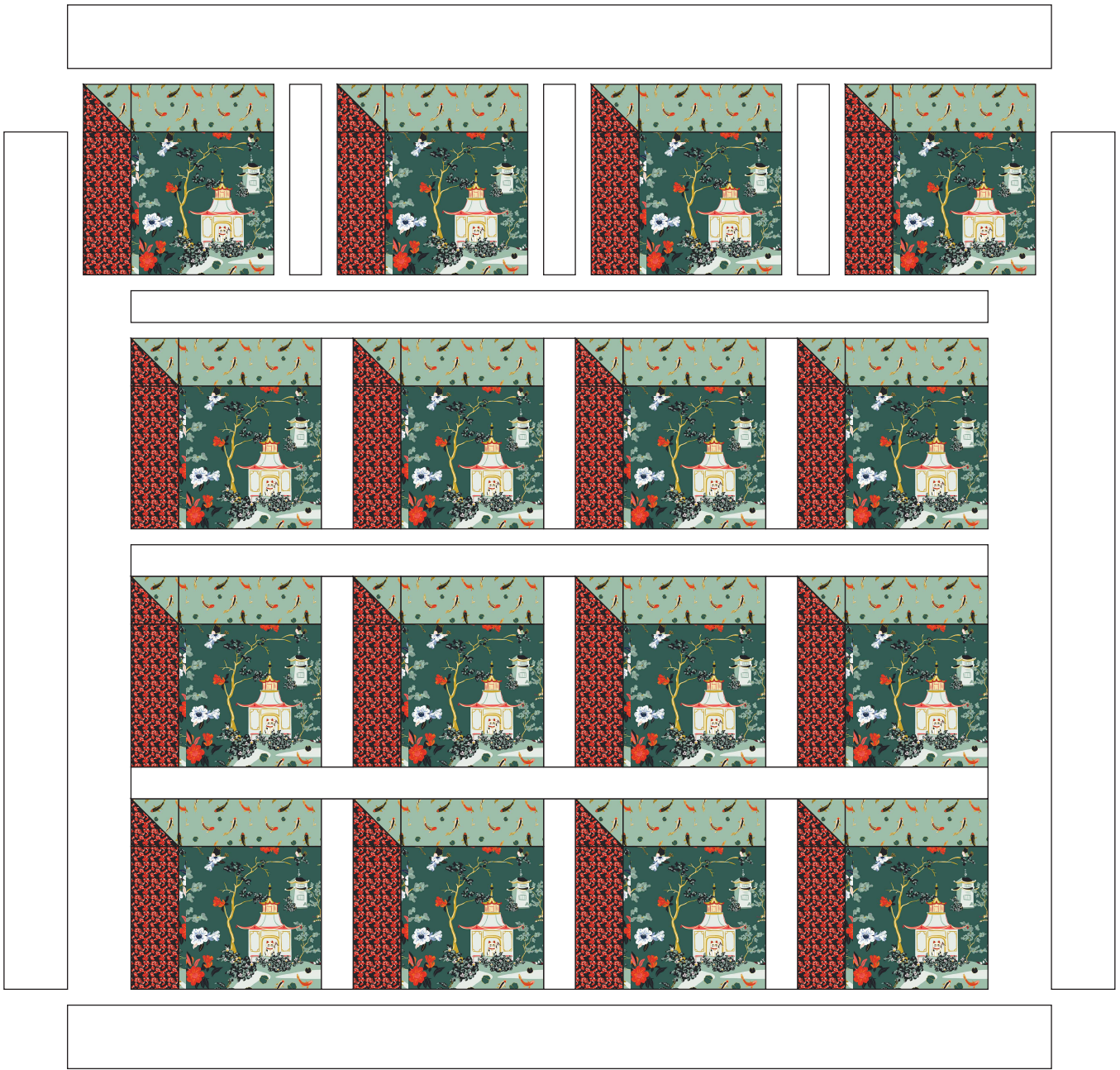
Quilt Assembly Diagram