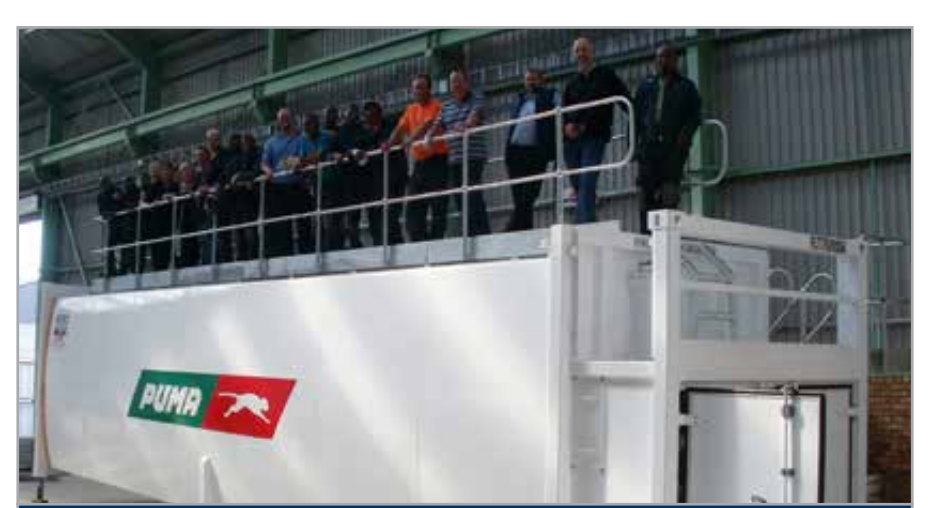
AS1657 designed and approved tank top access for dipping / maintenance of jiggle wire for floating suction / overall tank access