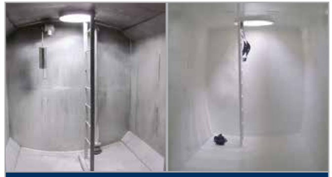
6mm 304 Stainless Steel or Epoxy Lined Carbon Steel Inner Tank