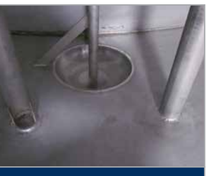
Water Sump & Extraction Point