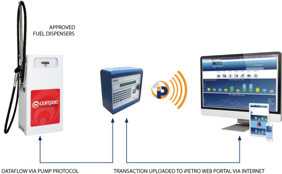
FIGURE S736 – 1