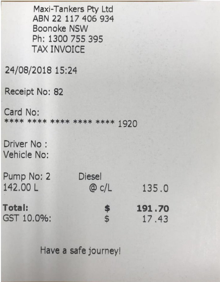
A Typical Receipt (Variant 2)