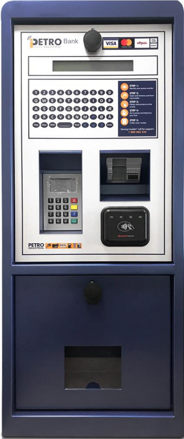
Petro Industrial Model iPETRO Bank Control System (Variant 2)