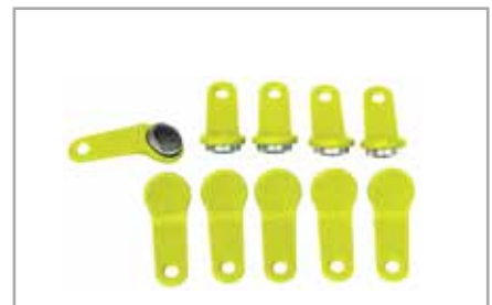
Pack of 10 Yellow User Keys: Code: F14144040