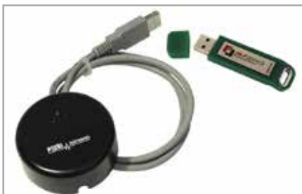
PC Interface: 1 x USB Converter & 1 x USB with Software Code: F1271000C