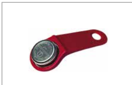
1 x Red Manager Key: Code: R1249600