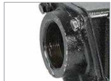
In / Out 2"