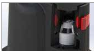
Built-In Non Return Valve