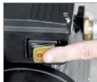
On / Off Switch