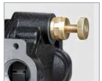
Adjustable bypass valve