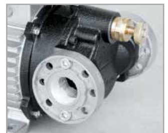
Flanged Connection (On request)