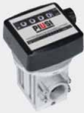
Oval Gear Meter K700 M Flow rate: 20-220Lpm Code: F00540000