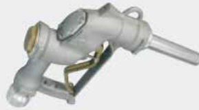
Nozzle A280 Flow rate 280Lpm with swivel Code: F13249000