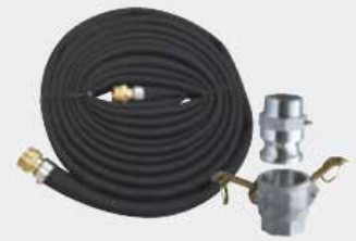
Hose Kit 1" 1/2 Code: F18798000 (hose 10 mt + Camlock) Code: F18799000 (hose 20 mt + Camlock)