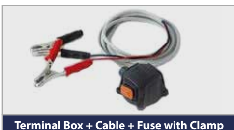
Terminal Box + Cable + Fuse with Clamp

1" BSP F: F16799000 3/4" BSP F: F17314000 1" BSP M: F17313000