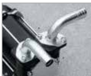
90° Hose Tail