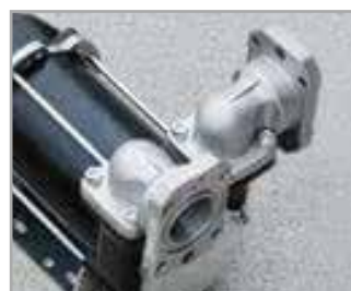
Flanged Elbow: F16178000 Elbow: F16770000