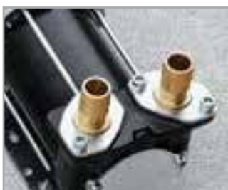
Straight Hose Tail Kit