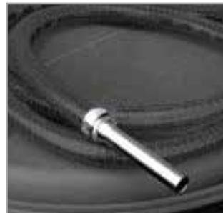
Stainless Steel Spout