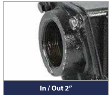
In / Out 2"