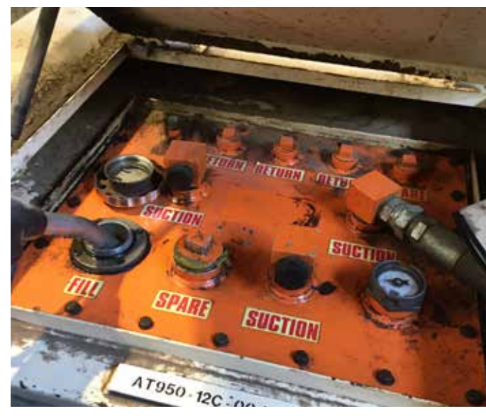
Be confident in the quality of fuel pumped into you machinery and equipment. The PETRO Technicians clean/drain your tank to ensure your fuel is clean, no water contamination and able to perform Polishing Fuel kits.