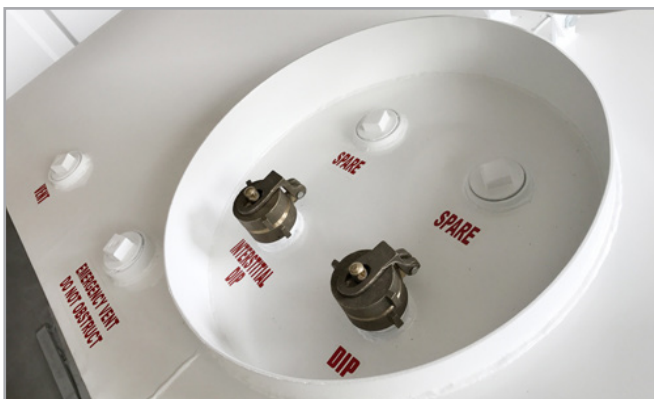
Dip and Interstitial Dip Points - enclosed in weatherproof housing