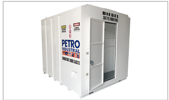
11,000L PETRO STORE - 110% Self Bunded (Double Wall) Small Foot Print Tank