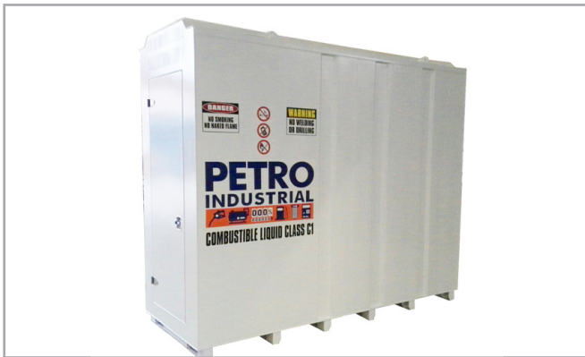
5,500L PETRO STORE - 110% Self Bunded (Double Wall) Small Foot Print Tank