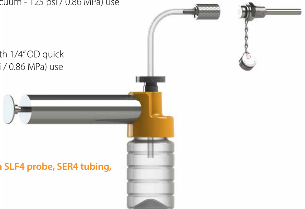
LT Sampling Tube with SLF4 probe, SER4 tubing, and Vacuum Pump

L sampling probe, thread-on, with 1/4" OD quick attach/detach (vacuum - 125 psi / 0.86 MPa) use 1/4" poly tubing.