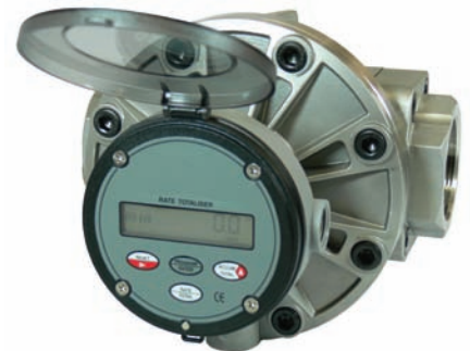
with LCD register