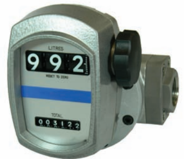
with 3 or 4 digit mechanical register