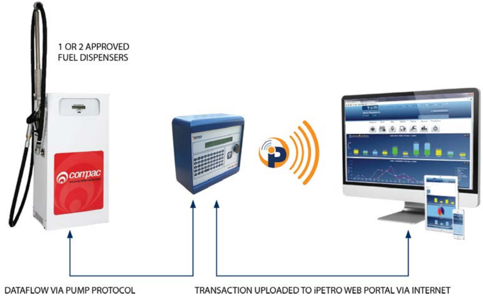
FIGURE S736 – 1