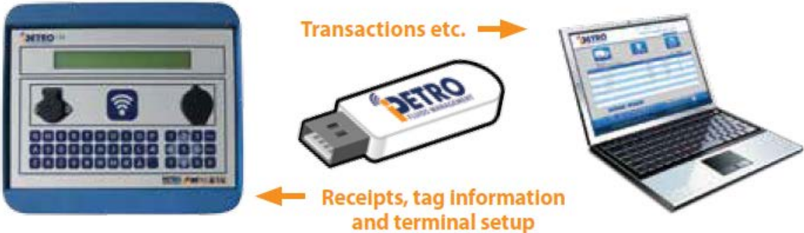
Petro Industrial Model iPETRO FMS LITE Control System (Variant 1)