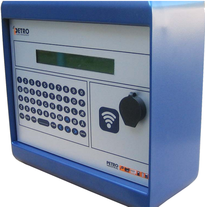
Petro Industrial Model iPETRO FMS PRO Terminal (Pattern)