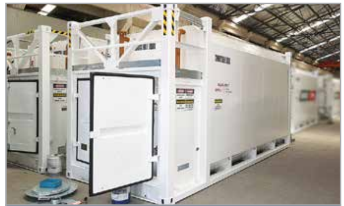
LT30 Tank in Preparation and Customization