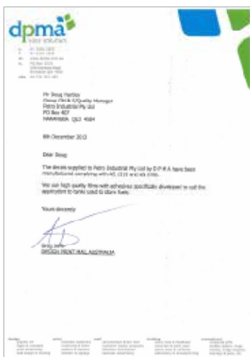
Decals manufactured to comply with AS1319 and AS2700.