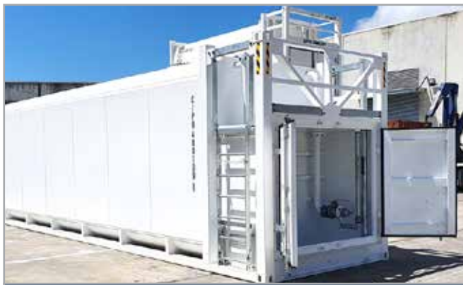
LT68 Tank Pump Bay and Ladder Assembly