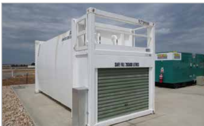
Liquitainer being used for Generators