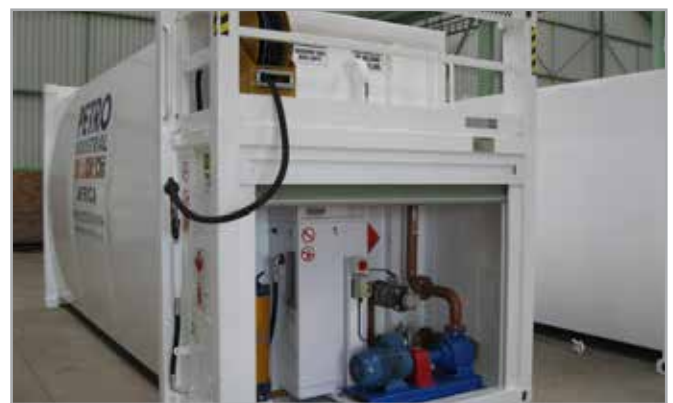
Liquitainer Integrated Self Bunded Pump Bay