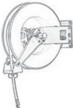
Wall application with outside output hose.