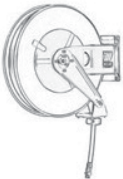
Wall application with inside output hose.