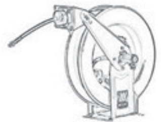
Bench application with frontal output hose.