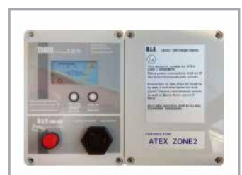
ATEX version available