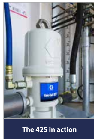
The 425 in action