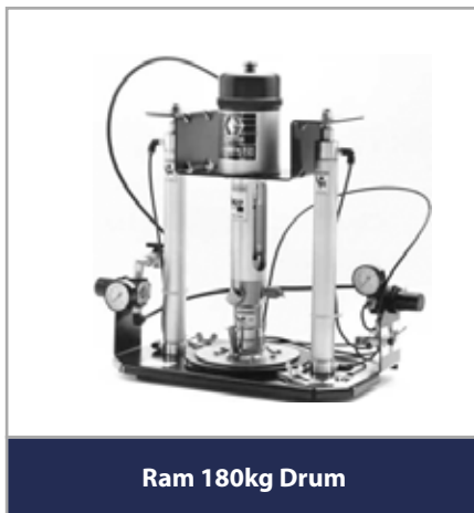
Ram 180kg Drum