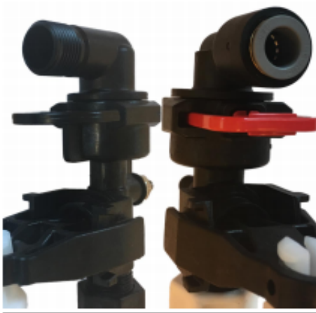
Img 9 - Float Assembly Fitting

You will need a 3/8 inch flexible line long enough to reach from the control head to the brine tank, with a little extra to allow for some slack. There are two common types of float fittings— Img 10 , the compression on the left and quick connect on the right. If you have the quick connect, simply push the tubing into the fitting, the tubing will stop and a little extra push will slide the tubing another 1/8-1/4