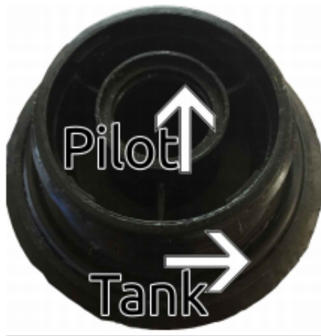
Img 3 - Control Head O-rings

Inspect the control head for any damage. Look for any damage to the threads (that screw into the tank), check all fittings to ensure they are whole and undamaged, and look for any other obvious signs of damage. Check to ensure the pilot and tank O-rings are present and free from nicks or kinks— Img 3 . It is also a good idea to verify that the riser tube fits snugly into the pilot hole and that the O-ring seals around it.