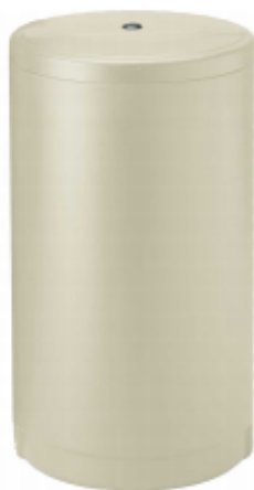
Img 7 - Brine Tank