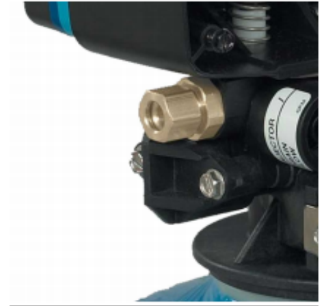
Img 10 - Brine Fitting

You will need a 3/8 inch flexible line long enough to reach from the control head to the brine tank, with a little extra to allow for some slack. There are two common types of float fittings— Img 10 , the compression on the left and quick connect on the right. If you have the quick connect, simply push the tubing into the fitting, the tubing will stop and a little extra push will slide the tubing another 1/8-1/4