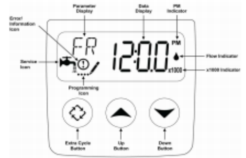
Img 14 - SXT Controls

Time of Day, tells the system what the current time is. To change the time, press and hold the up OR down arrow until the service icon is replaced with the programming icon. Use the up and down arrows to set the time of day (PM is indicated in the upper right corner of the screen). Once the time is set, press the extra cycle button or don't press anything for 5-10 seconds to return to normal operation.