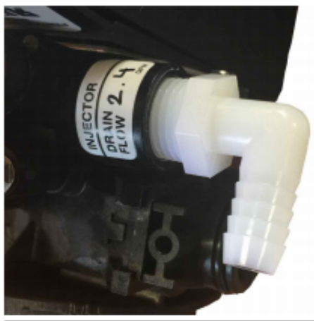
Img 5 - Drain Fitting

** Please note: ** Drain water comes out under line pressure, so it can be run vertically to connect to an overhead drain pipe.