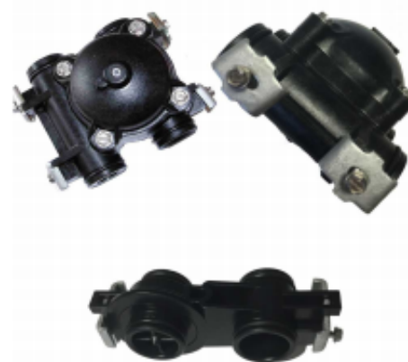
img 12 - 3 Common Fleck Meter Assemblies