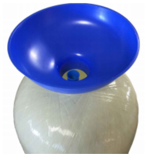
Img 2 - Tank with Funnel

Loading the resin is fairly easy. Some systems include a funnel to make loading the resin easier— Img 2 . If you do not have a large funnel to fit or the funnel that came with it is broken, the next best thing to use is your household blender pitcher. Take the bottom blade section off of your blender and the pitcher will screw directly into your tank making a great funnel.