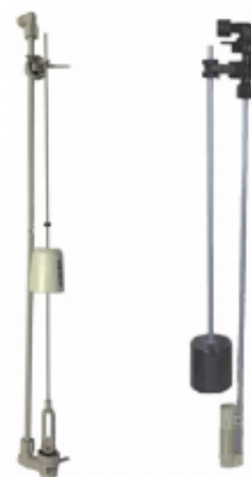
Img 8 - Two Most Common Float Assemblies

Remove the float assembly (you may need to remove a nut or two before removing the float) and remove any shipping bands that may be in place. The float will usually arrive preadjusted, but it is a good idea to check it. *!* The float is NOT used to adjust the salt dosage. *!* The float assembly is a safety mechanism designed to prevent overfilling in the event of a control head malfunction. It should be set to shut the water off before the water hits the overflow hole (the lowest hole on the outside of the tank). If it needs adjusted simply slide the grommets up or down until the float is properly positioned. If adjusting results in excess rod above the top of the brine well you may cut off the excess, but be sure to leave 1–2 inches (2.5–5 cm) of the