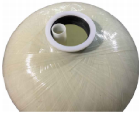
Img 1 - Tank & Riser

Look inside your resin tank and there will be a plastic tube inside— Img 1 . This is your riser (or distributor) tube that helps manage water flow through the system. Inspect the riser tube to make sure it is intact and without damage, removing it from the tank to ensure the distributor basket on the end is intact as well.. These are very durable and would rarely ever be damaged, but it is a good idea to check. ** Verify the riser tube fits and seals into the control head. ** A mismatched riser tube will prevent proper treatment, and it is much easier to correct the problem before the media is loaded. Place the riser tube back into the tank, there is a depression at the bottom of the tank in the center that it will sit in. With the riser tube properly positioned, ensure that it is no more than 1/4 inch (6 mm) above the top of the tank. If higher than 1/4 inch (6 mm) use a sharp knife, PVC cutter, or similar tool to cut it flush with the top of the tank. ** Do not cut the riser tube too short. ** If your riser tube is too short it will not seal inside the control head properly and your system will not work properly.