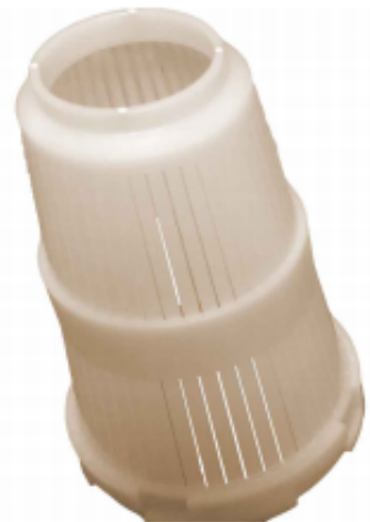
Img 4 - Top Distributor Basket

Depending on system configuration your system may include a top distributor basket— Img 4 . If you have more than one system you can match it up to the control head and riser to ensure it goes on the right system. In general, water softeners ship with an upper basket while other systems do not. If you did not receive one that is normal, they are not required and you can use the system without one. If you do have one the larger end will fit inside the bottom of your control valve, with the smaller end sliding over the riser tube pointing down into the tank. Most styles push into the control head and then turn clockwise to lock onto the control head, some just push in to the control head until snug.