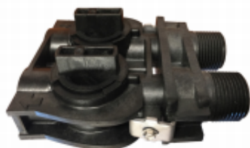
Img 11 - Connection Fitting

Your unit comes with connection fittings that allows the control head to connect to standard plumbing, either a single stainless steel bypass valve or a two part plastic bypass and yoke connection— Img 11 . The included connection may or may not be installed on the control head, if it is, remove it for this step. To remove it, locate the metal clips holding it in place. Remove those and the connection will pull away from the control head. Note the direction of flow as indicated by the arrows, also note the direction of flow on the head itself, also indicated by arrows. The inlet side arrow will point toward the front of the head for incoming (untreated) water, the outlet side arrow will point away from the head for outgoing (treated) water. *!* Correct inlet/outlet connections are vital. *!* Connecting the system in reverse (with the incoming water connected to the outgoing connection) will prevent proper operation