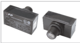
Optional photo control