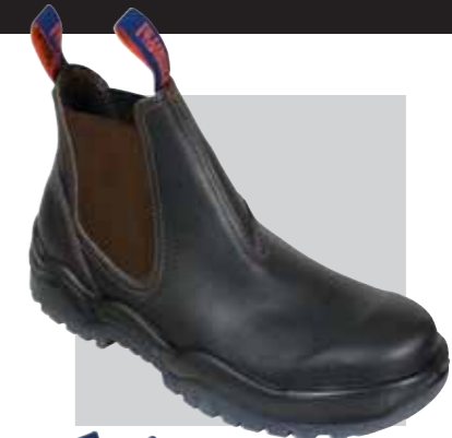
916030 Brown Kip Elastic Sided Boot TPU/PU Toughsider sole Airzone comfort system OrthoTec PU innersole Sizes 5-14 (6.5 -10)