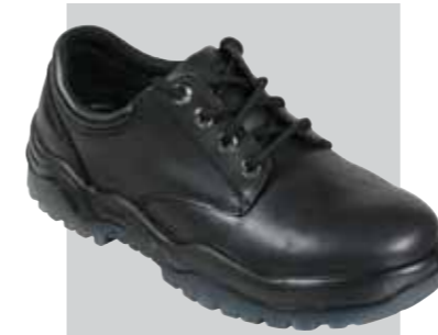
910025 Black Derby Shoe TPU/PU Toughsider sole Airzone comfort system OrthoTec PU AIR innersole Padded collar Sizes 3-14 (6.5 -10.5) • Available in women's fittings