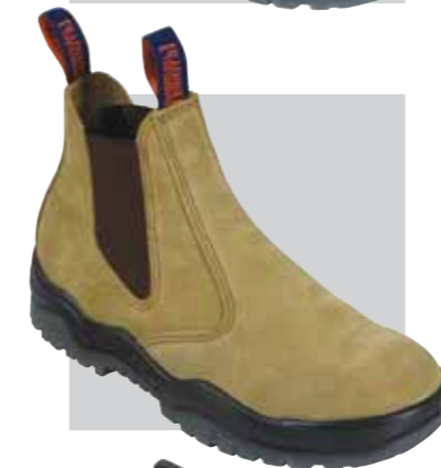
916040 Wheat Elastic Sided Boot TPU/PU Toughsider sole Airzone comfort system OrthoTec PU Air innersole Sizes 5-14 (6.5 -10.5)