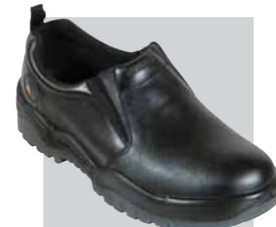
915025 Black Slip on Shoe TPU/PU Toughsider sole Airzone comfort system OrthoTec PU innersole Padded collar Sizes 3-14 (6.5 -10.5)