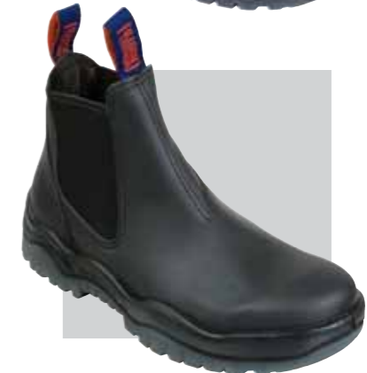
916020 Black Kip Elastic Sided Boot TPU/PU Toughsider sole Airzone comfort system OrthoTec PU innersole Sizes 5-14 (6.5 -10)