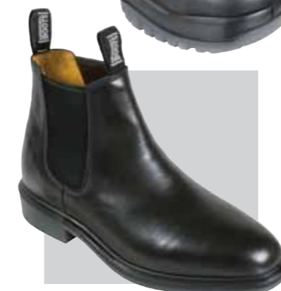
805025 Black Riding Boot TPU/PU sole OrthoTec PU innersole Rigid instep shank for horse riding Sizes 4-13