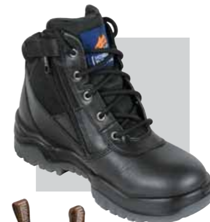
961020 Black Kip Boot TPU/PU Toughsider sole ZipSider style Airzone comfort system OrthoTec PU innersole Fully lined Padded tongue and collar Sizes 5-14 (6.5 -10.5)