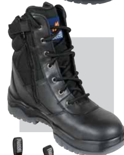
951020 Black Highleg Boot TPU/PU Toughsider sole ZipSider style Airzone comfort system OrthoTec PU innersole Fully lined Padded tongue and collar Sizes 5-14 (6.5 -10.5)