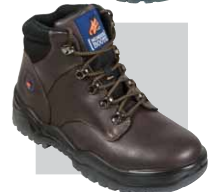
917030 Claret Kip Lace-up Boot TPU/PU Toughsider sole Speed lacing D rings Airzone comfort system OrthoTec PU innersole Fully lined Padded tongue and collar Sizes 3-14 (6.5 -10.5)