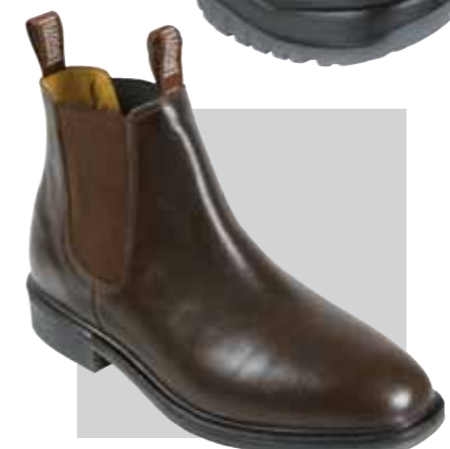
805070 Brown Riding Boot TPU/PU sole OrthoTec PU innersole Rigid instep shank for horse riding Sizes 4-13