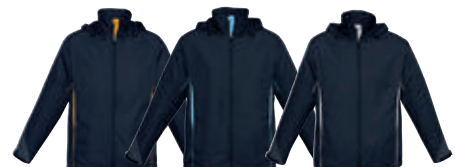
NAVY/GOLD NAVY/SKY NAVY/WHITE