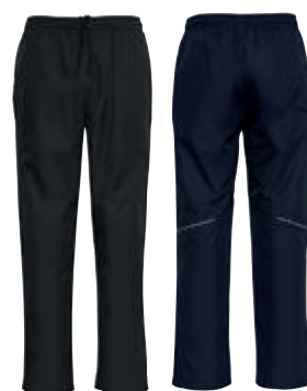
BLACK NAVY (BACK)