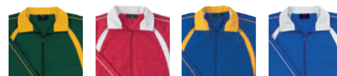
FOREST/GOLD RED/WHITE ROYAL/GOLD ROYAL/WHITE