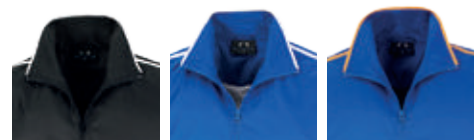
BLACK/WHITE ROYAL/WHITE ROYAL/GOLD