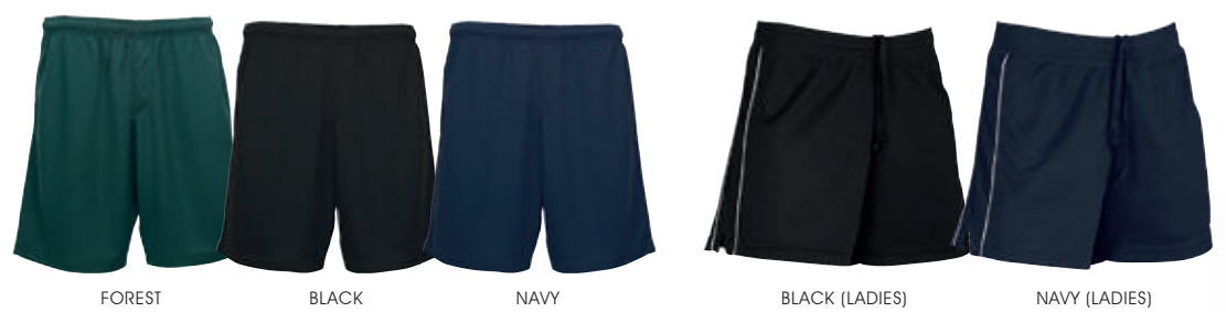
FOREST BLACK NAVY BLACK (LADIES) NAVY (LADIES)