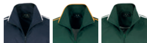
NAVY/WHITE FOREST/GOLD FOREST/WHITE