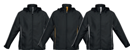
BLACK/ASH BLACK/GOLD BLACK/WHITE