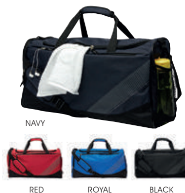
BB411 SPORTS BAG

FEATURES Padded compartment for laptop storage - up to 14" screens • Padded airflow mesh back panel • Ergonomic, adjustable shoulder straps • Dual-zippered main compartment • Side-mesh water bottle pocket • Comfort grip carry handle • Media compartment/earphone port • Webbing strap for extra attachments • Heavy duty base with rubber feet • 350mm (L) x 450mm (H) x 250mm (D)