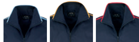
NAVY/SKY NAVY/GOLD NAVY/RED