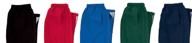
BLACK RED ROYAL FOREST NAVY