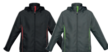
BLACK/RED GREY/FLUORO LIME