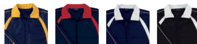
NAVY/GOLD NAVY/RED NAVY/WHITE BLACK/WHITE