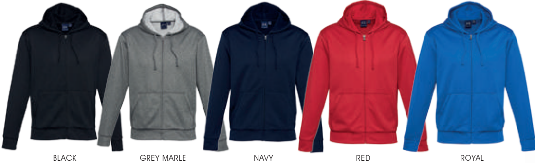
BLACK GREY MARLE NAVY RED ROYAL