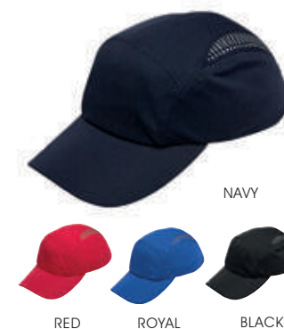
C412 SPORTS CAP

FEATURES Main Compartment with large U-shaped opening • Separate zippered wet/dry compartment • Detachable, adjustable padded shoulder strap • Zippered front accessory pocket • Additional end mesh pouch • Dual nylon handles • Heavy duty base with rubber feet • 600mm (L) x 350mm (H) x 300mm (D)