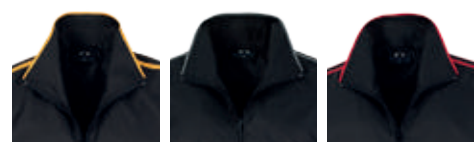
BLACK/GOLD BLACK/GREY BLACK/RED