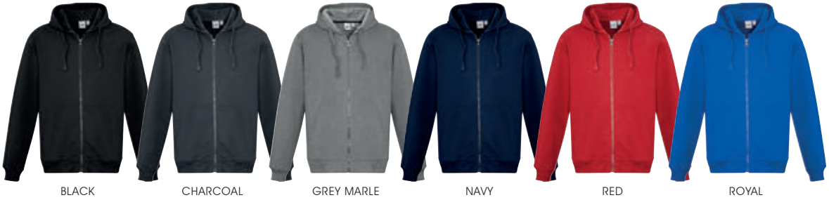
BLACK CHARCOAL GREY MARLE NAVY RED ROYAL