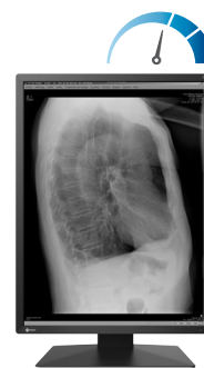
Instant Backlight Booster Off

DICOM Part 14 is not supported while Instant Backlight Booster is on.