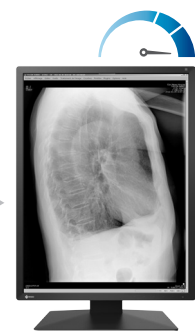
Instant Backlight Booster On