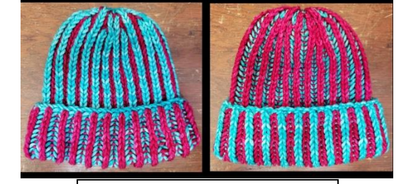
"Baby Brioche Hat" Pattern available in store and online via Ravelry. Made with 2 different colors of Malabrigo "Rios"

Wisconsin Sheep & Wool Festival is September 6<sup>th</sup>-8<sup>th</sup>, 2019 We will be having several instore specials/sales that weekend, so be sure to make Needles 'n Pins a stop on your list for that weekend!