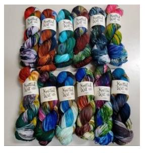
Knitted Wit "Victory Sock" in the 'National Parks' colorways! This is a fingering/sock weight superwash merino wool/nylon blend, containing 420 yards, and retailing for $28.00/hank.

Hikoo "Simplicity Spray" from Skacel is a DK weight Superwash Merino/Acrylic/Nylon blend, containing 456 yards, and retailing for $34.00/skein!