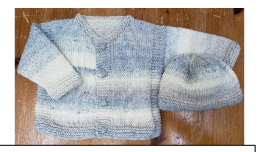
"Little Bear Cap & Cardigan" Pattern available in store only. Made with Hikoo "Simplicity Spray"