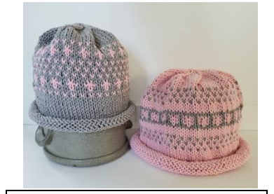
"Cotton Cutie Caps" Pattern available in store and online via Ravelry. Made with Sirdar "Snuggly 100% Cotton"