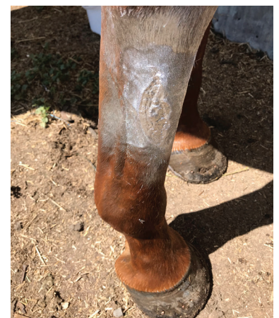
Before and after application of AbbeyShield™