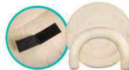
Removable backrest with easy velcro