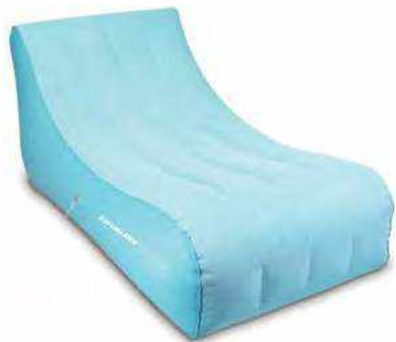
90571 Cloud Chaise Oxford Fabric Float

Single chaise float (sold one piece per unit). Case Qty: 6