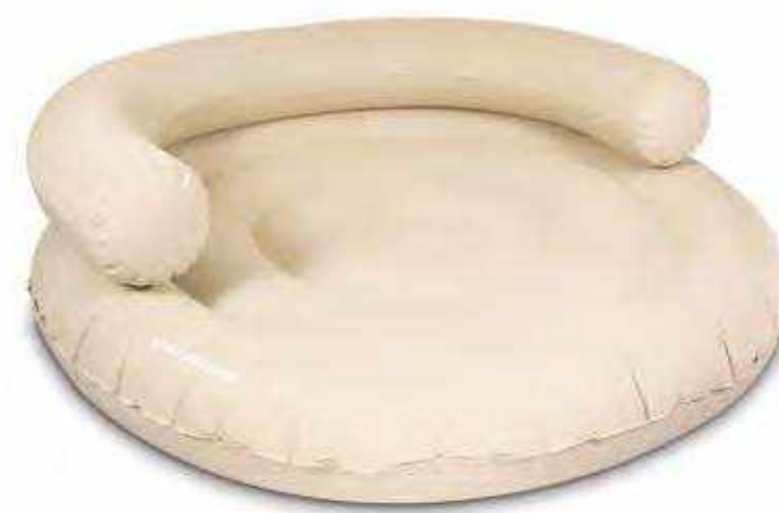
90575 Cloud Chaise 360 Oxford Fabric Float

Double chaise float (sold one piece per unit). Case Qty: 4