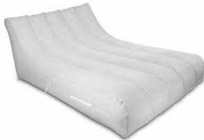
90572 Cloud Chaise XL Oxford Fabric Float

Single chaise float (sold one piece per unit). Case Qty: 6