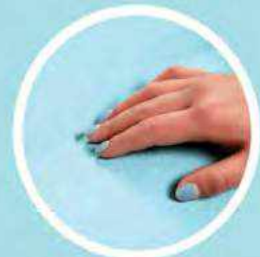
SOFT FABRIC TOUCH

Elevate your poolside experience with our "Cloud" fabric-top float series. Our new "Oxford" fabric-infused PVC technology provides a comfortable soft fabric feel. This allows you to enjoy the added comfort without having to deal with the hassles of fabric covers, internal bladders & drainage.