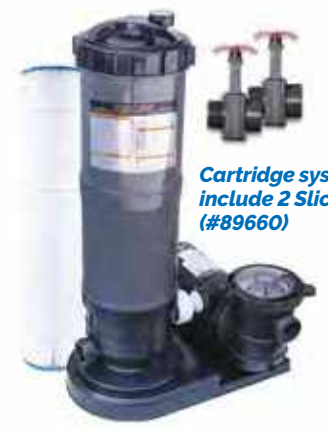
Cartridge systems include 2 Slice Valves (#89660)

Reduce your carbon footprint & energy bill.