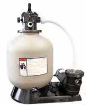
Sand filter systems include 1 Slice Valve (#89660)