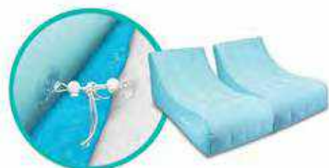
Connectable with bungee loop system

Island style chaise float with backrest (sold as one piece per unit). Case Qty: 4