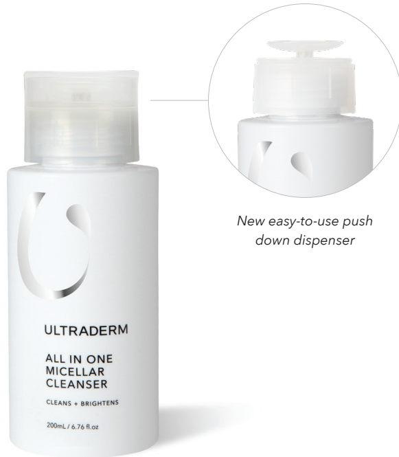
New easy-to-use push down dispenser