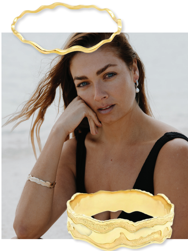
Island Bound Wave Bangle | Island Bound Pelsaert Bangle Wide | Pia Huggies Earrings with South Sea Pearls