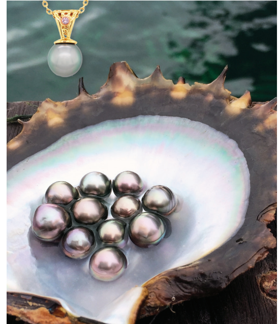
Argyle Filigree Pendant with Abrolhos Black Pearl + Pink Diamond

The unique black colour of our pearls comes from the oyster shell itself. Producing a rainbow of pastels greys with pink, blue and green hues. They mirror the unique colour of the shell they grew in. With the pink hue the rarest of them all.