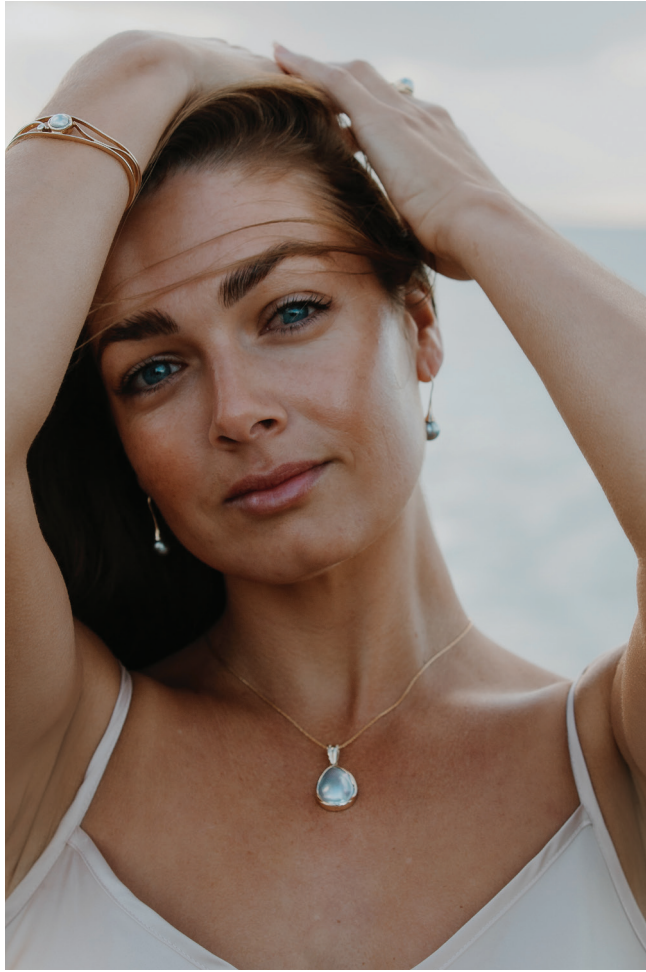
Lexi Cuff with Pearl + Diamond | Island Bound Wave Pendant with Abrolhos Mabe Pearl | Solid Lexi Sparkle Ring | Signature Flute Earrings with Abrolhos Islands Pearls