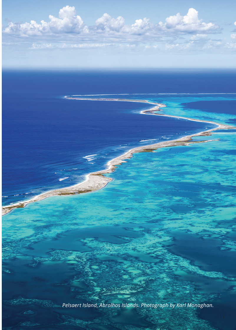
Pelsaert Island, Abrolhos Islands.