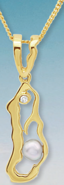
Basile Island Pendant with Abruolhos Pearl + Diamond

Home of our Pearl Farm and our Heart & Soul