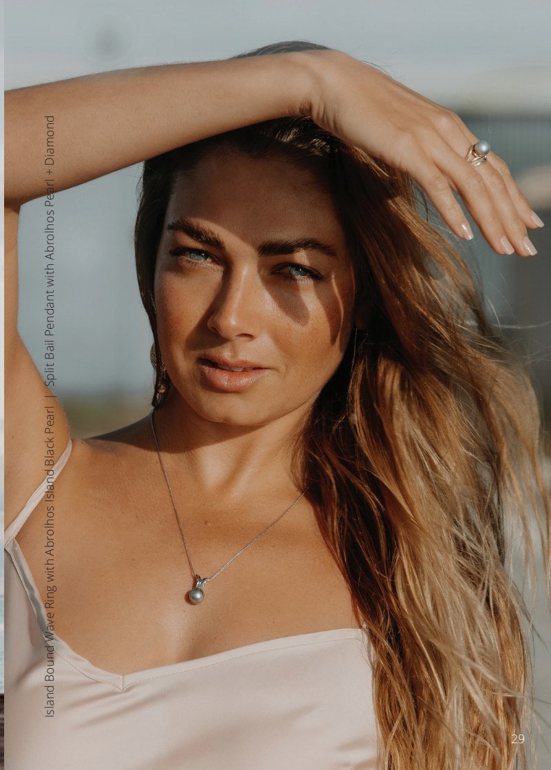
Island Bound Wave Ring with Abrolhos Island Black Pearl | Split Ball Pendant with Abrolhos Pearl + Diamond