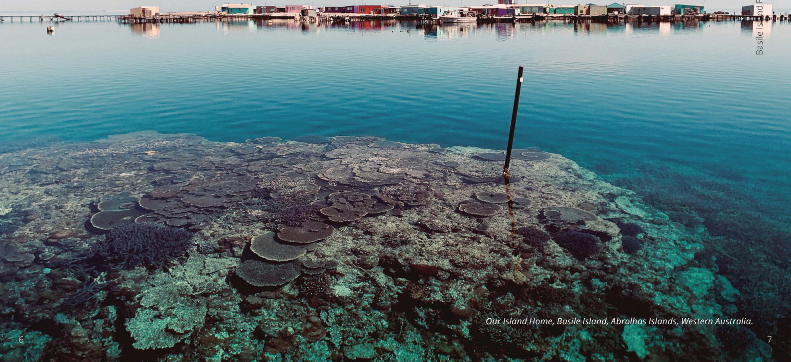
Our Island Home, Basile Island, Abruolhos Islands, Western Australia.