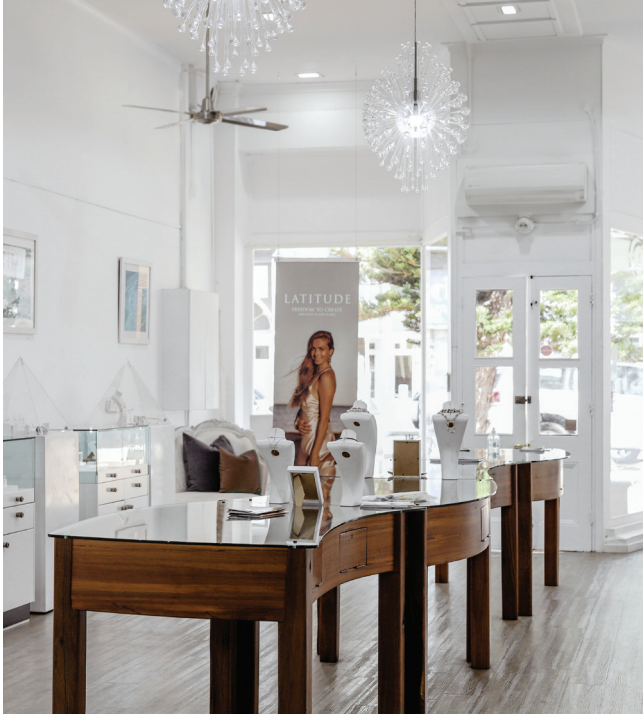
Latitude Boutique Showroom, 169 Marine Terrace, Geraldton.