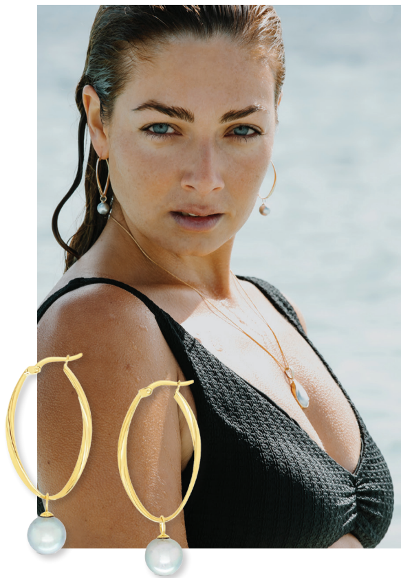
Slim Island Hoops with Interchangeable Black Pearls | Island Bound Wave Pendant with Abrolhos Mabe Pearl | Pia Huggles | Split Ball Pendant with Abrolhos Pearl + Pink Diamond from the Argyle Mine