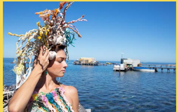
Entry for Wearable Art 2021

An unique art exhibition that intertwines the creative art making of the local community and a deep passion to protect and preserve the Abrolhos Islands, home to our Pearl Farm.