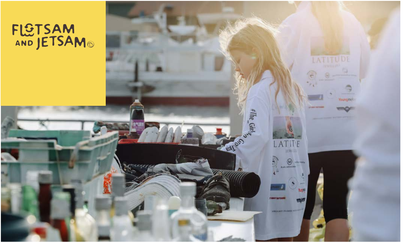
Collection day, Geraldton Fisherman's Wharf, Western Australia