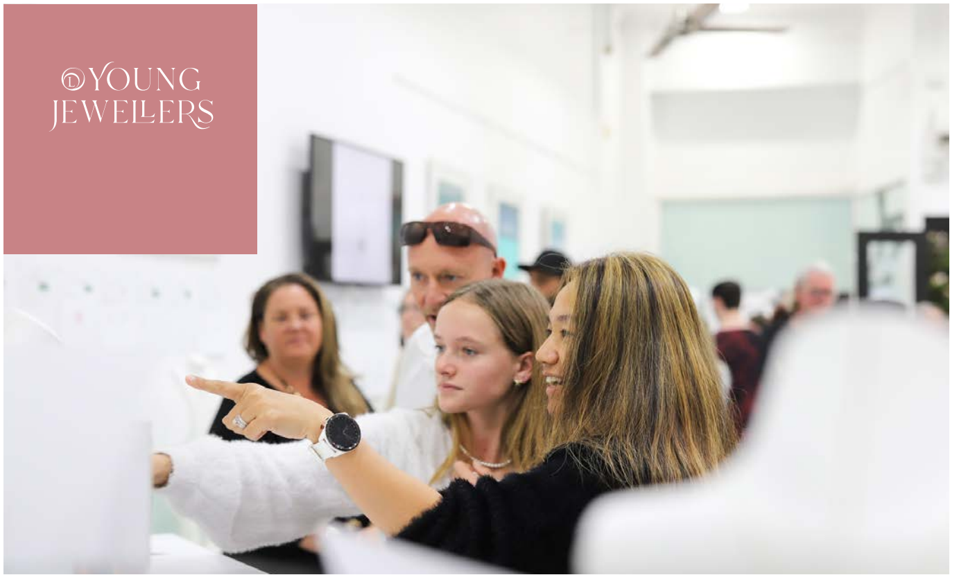
Young Jewellers Awards event at Latitude Jewellers