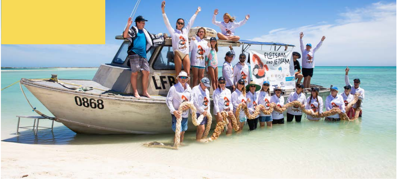
Clean up weekend at the Abrolhos Islands, Western Australia