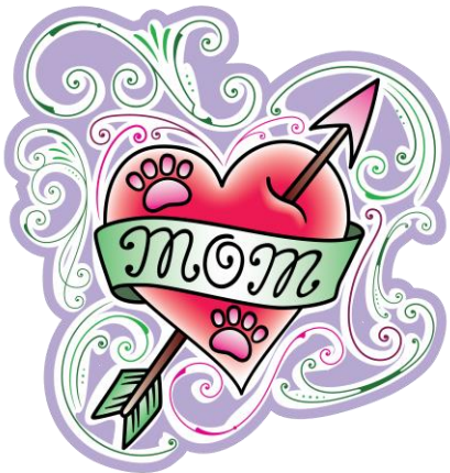
Moms with Fur Babies