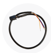
0.35 m 4pin Automotive adapter cable