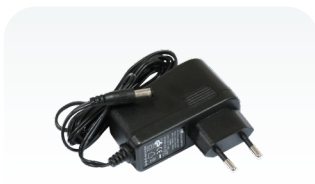
24 V 0.38 A power adapter