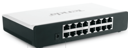
Side Vent Bottom Vent 94V0 Fireproof Plastic Housing