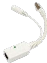
Gigabit PoE injector