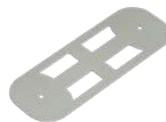
Ceiling mount base