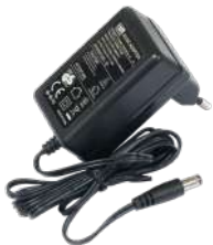
24 V 0.8 A power adapter